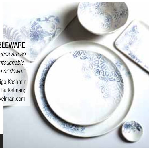
TABLEWARE "These pieces are so beautiful but not untouchable. Dress them up or down." dbO Home Indigo Kashmir Collection by Burkelman; shopburkelman.com