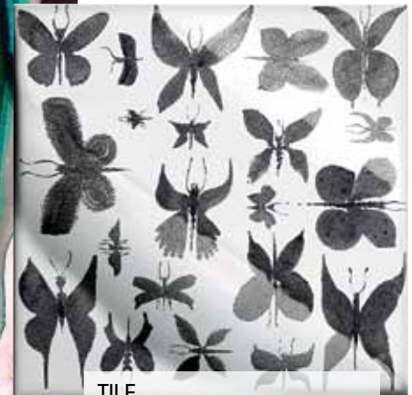
TILE "A design that's graphic without feeling abrupt." Hand-painted ceramic Papillon tile by Ruben Toledo for Ceramica Bardelli; ceramicabardelli.com