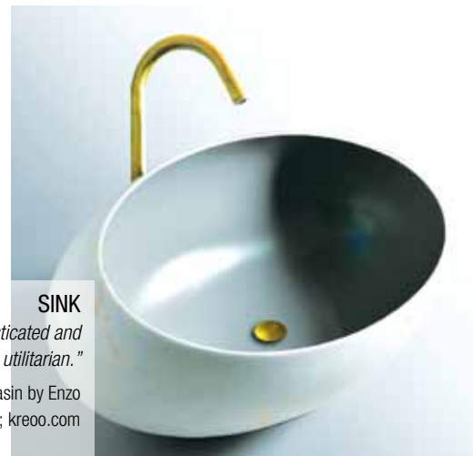
SINK "It's sexy, sophisticated and doesn't feel utilitarian." Gong marble washbasin by Enzo Berti for Kreoo; kreoo.com