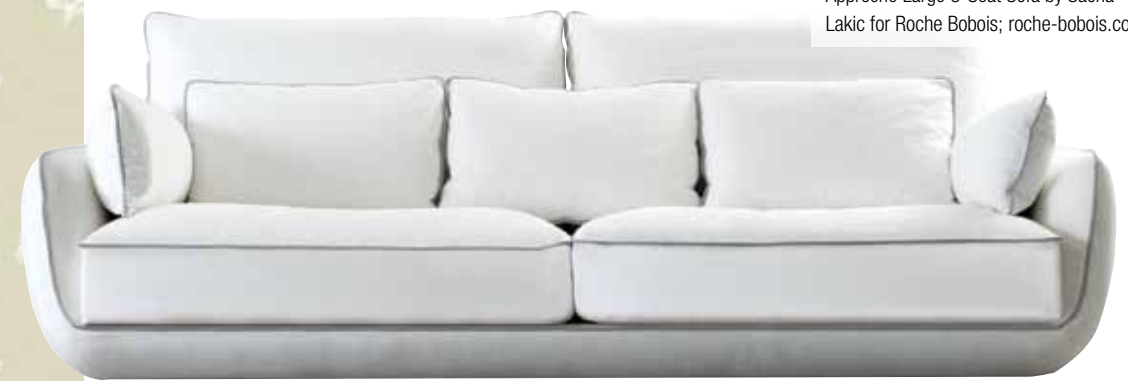
SOFA "Ridiculous!" Approche Large 3-Seat Sofa by Sacha Lakic for Roche Bobois; roche-bobois.com

"Lately I'm tuning into designs that haven't been stripped down and regurgitated to the masses. I love pieces that add an element of glam and suggest a little bit of personality— like, 'Hey, I love color and I don't take myself too seriously!'"